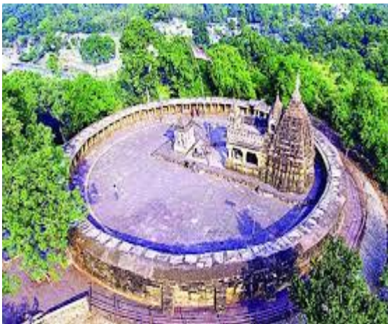
CHAUSATH YOGININ TEMPLE