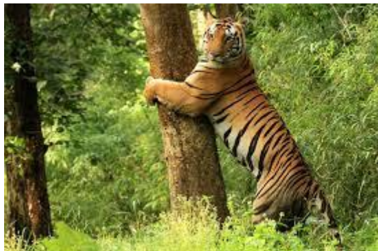
BANDHAV GARH NATIONAL PARK KANHA NATIONAL PARK (APPROX. 200 KM)